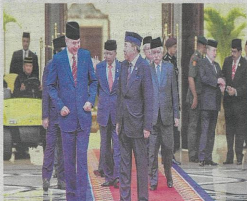
SULTAN Sharafuddin bersama Sultan Nazrin Shah selepas Mesyuarat Majlis Raja-Raja ke-254 di Istana Negara semalam.

KUALA LUMPUR - Sultan Selangor, Sultan Sharafuddin Idris Shah mempengerusikan Mesyuarat Majlis Raja-Raja ke-254 di Istana Negara semalam.