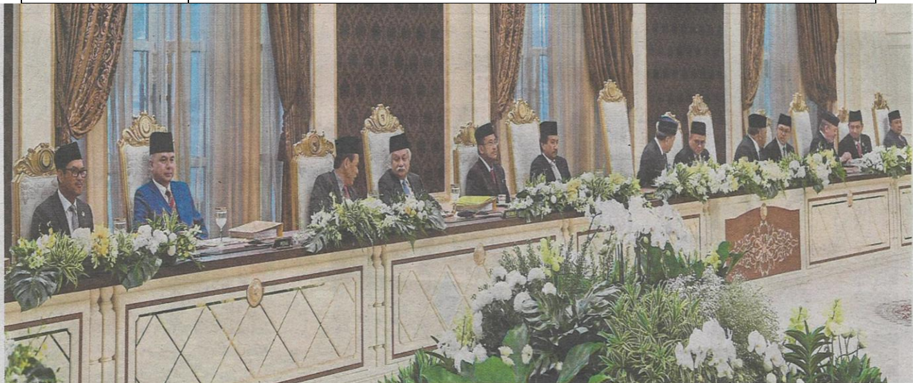
Sultan Sharafuddin diiringi Menteri Besar Selangor, Amirudin Shari mempengerusikan Mesyuarat Majlis Raja-Raja Ke-254 di Istana Negara, semalam.