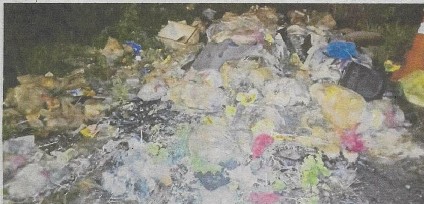
Longgokan sisa makanan dibuang warga asing di Jalan SP1, Bandar Saujana Putra Banting, Sabtu lalu.