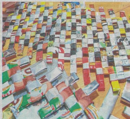
Thy has started weaving baskets with 3-in-1 drink sachets.

"I have spotted green pigeons, coppersmith barbet and black-naped orioles," he noted.