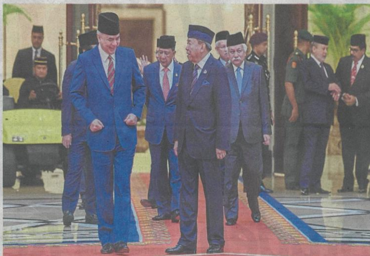
Sharing a light moment: Sultan Sharafuddin and Sultan Nazrin having a conversation after the 254th meeting of the Conference of Rulers at Istana Negara in Kuala Lumpur.

On Tuesday, the Malay Rulers held a pre-council meeting at Istana Negara.