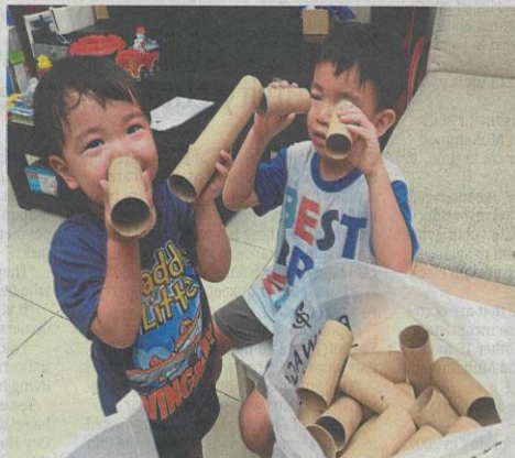
Yew is collecting used toilet paper rolls to turn into toys for her sons.

more birds of different species have been visiting his house and the neighbourhood due to the increase in the number of plants and trees.